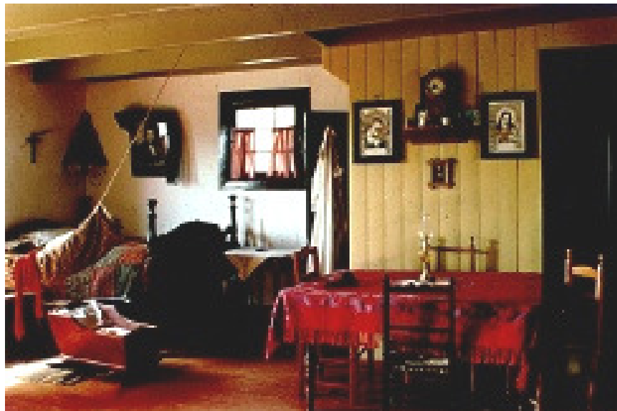
Parks Canada: Riel House in Winnipeg, the baby hammock or “wewepisoni” can be seen on the left.