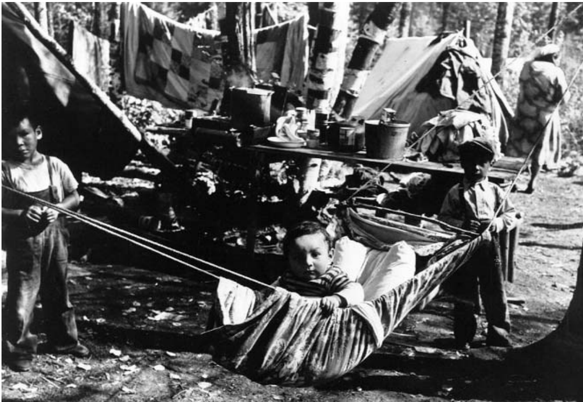
A baby in a barsou at a rice picking camp in the Whiteshell area of Manitoba (PAM).

“ Aen barsou ” is a baby swing that was made using two pieces of small diameter rope strung like hammock strings across the room, usually hung at night above the parents bed. A wood stretcher was inserted at the head end to keep the ropes apart. A blanket was then wound over the ropes to fashion a hammock for the baby to lie in. When the Metis camped out to pick seneca root or berries the barsou was hung between the tent posts of their wall tents.