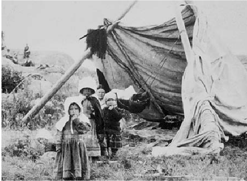
Barsou hanging in a lean-to on the trail.