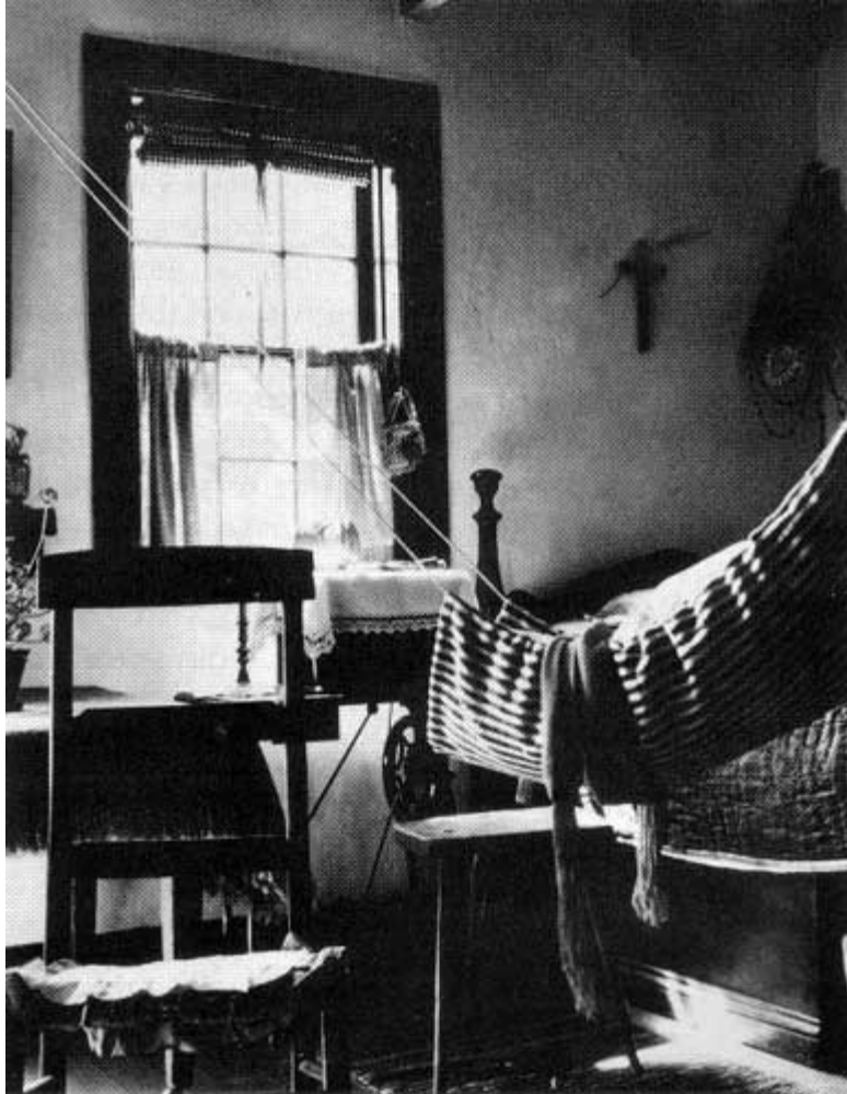
Parks Canada: close-up of a barsou.